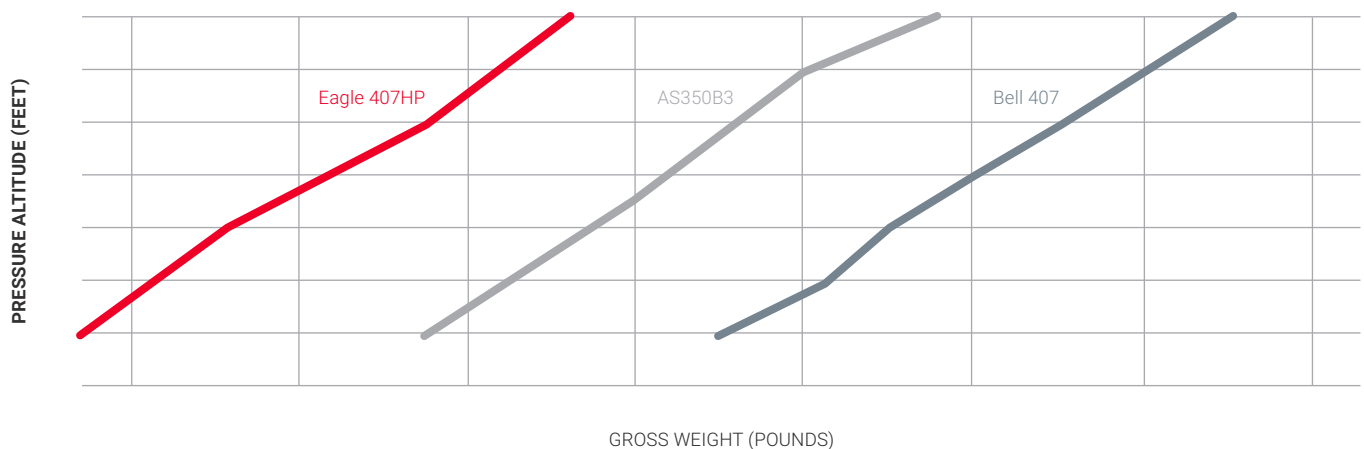
HOVER CEILING OUT OF GROUND EFFECT COMPARISON (20°C)

Developed with 'safety, performance and affordability' as top requirements, the Eagle 407HP is ideally suited for playing an even more demanding role wherever outperformance is a must: in security and law enforcement, utility services such as pipeline and power line construction, forest management, heli-sports, firefighting, EMS and more.